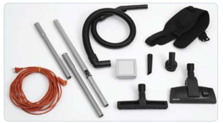
Wide selection of accessories available to meet specific applications