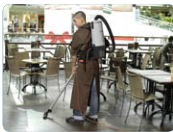
For convenient cleaning of those hard to reach places, the GD 5/GD 10 backpacks are the answer

There are many things that should be present in a good backpack vacuum cleaner. It should be light in weight, with even weight distribution, and the noise level must be as low as possible. Without these basics, a backpack vacuum cleaner is uncomfortable and impractical to operate. At the same time, the power needs to be sufficient for fast, effective cleaning, and the dust bag must be large enough to avoid constant changing. Above all, the cost of cleaning must be right!